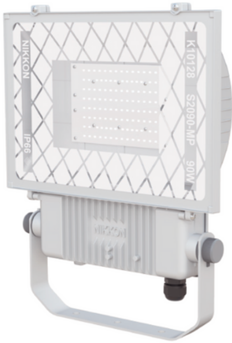
ARGENTO K10128 90W