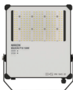
MADON P15 150W