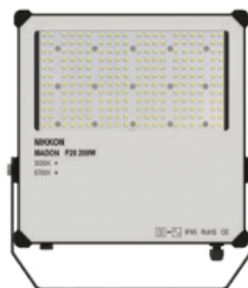
MADON P20 200W