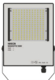
MADON P10 100W