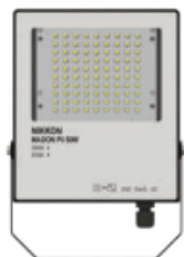
MADON P5 50W