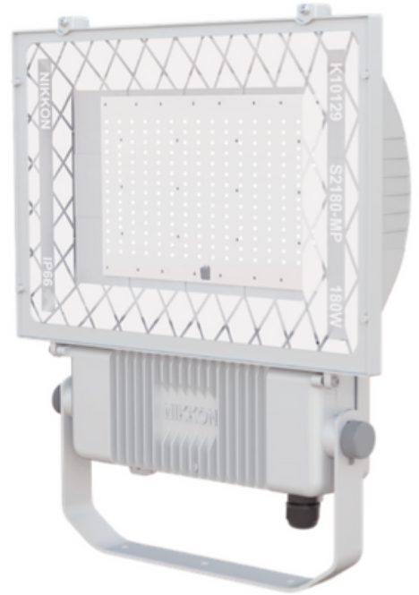
ARGENTO K10129 180W